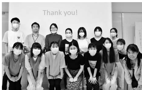
Figure 4. Group photo of the lecturers and students.

Mongolian lecturer in a Mongolian traditional costume (back row, 3 rd person from left), Japanese lecturer (back row, 2 nd person from left), and the organizer of the lecture series (front row, 1 st person on the right).