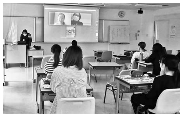
Figure 3. Online discussion connecting students with a Mongolian healthcare provider.

Finally, in lecture 12 (International cooperation), the Japanese instructor showed several videos about JICA and JOCV activities in developing countries. The Mongolian lecturer talked about a Mongolian-Japanese cooperative program focused on sleep education that was initiated by a Japanese lecture five years ago and led to a Mongolian lecturer's presentation in Japan on sleep medicine training and research. She told stories about the ongoing cooperation related to these lectures and thus gave the nursing students a strong impression